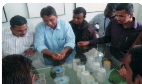
The training for FINISH Project staff in progress

Two days training program, for Financial Inclusion Improves Sanitation and Health (FINISH) project staff, was organized on Feb 09 and 10, 2010 at ESAF Training Centre - Nagpur. The Objective of the programme was to train the participants regarding the FINISH Project and to discuss the plans and strategies. They also discussed on issues like sanitation obstacles. Valentine Post from WASTE guided the participants on the supportive tools. Later the participants were divided into three groups for field visits and each group visited different areas like Sewerage Line at Sirispeth,