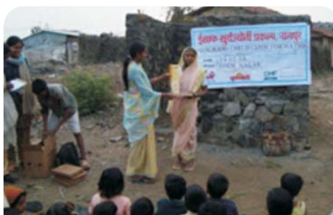
Distribution of solar lamps in progress

In order to create awareness among the locals related to solar light ESAF staff mobilized people from the community including hawkers in the Nagpur Area. Solar Lamps were distributed by