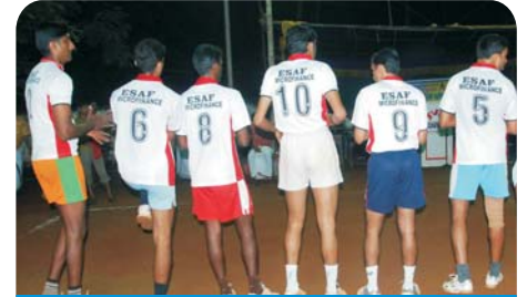
The St. George team sponsored by ESAF