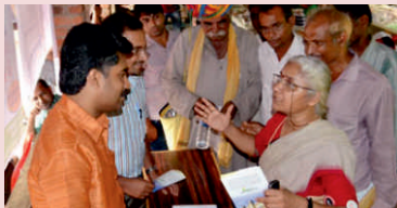
Activist Ms. Medha Patkar understanding about The Livable cities Project of ESAF from the Project team.