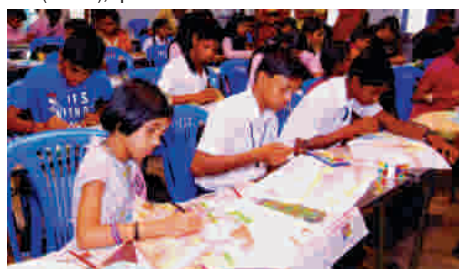
A scene from the painting competition held as part of 'Gooseberry Fest'