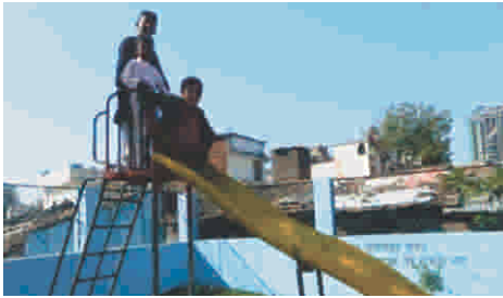
Children at the newly built slide in Nagpur park

The Livable cities India programs promoted by ESAF and Health Bridge, Canada completed Phase 2 in the cities of Nagpur and Bangalore in February 2012. In both the cities, the project outcome advocated for more public spaces such as parks so as to enable children to be engaged in increased outdoor games. The studies conducted by ESAF in the Phase 1 revealed that there were not enough safe spaces for children in the cities for outdoor games. 47% parents said that their children resorted to indoor games due to space constraints. As a result, the children are deprived of a physically active life. Playing on streets is another option but unfortunately streets are hardly better. The project helped the children of the area to get a new lease of life. The park, which was not functional for several years, was made fully functional by the ESAF team with the support of Local Corporator, Park Volunteers (developed for the project) and active involvement of Residents Association. ESAF was in the forefront for conducting discussions with the officials of Nagpur Municipal Corporation.