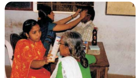
Free eye-care camp in progress

ESAF SHG Federation (Valappad Branch) and