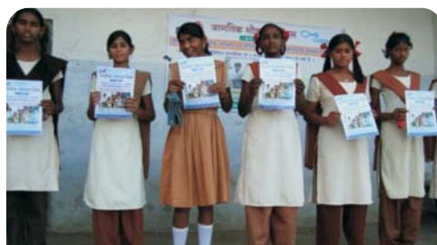
School children displaying posters on good hygiene practices

Activities like Street Plays, Poster Show, and Pamphlet Distribution were organized. The theme of the street play was based on the ill-effects of open defecation, benefits of toilets, and importance of hygienic habits. Awareness program at school was organized in association with Hygiene club. Both students & teachers participated in the program.