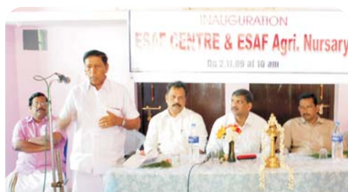
V.C. Kabeer inaugurating the function

V.C. Kabeer, former Health Minister, Govt. of Kerala, inaugurated ESAF Centre at