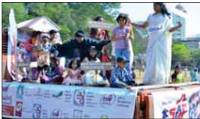
A still from the tableau organized by ESAF

ESAF participated in the Republic Day procession organized by the youth wing of Vyapari Vyavasayi Ekopana Samithi, Mannuthy. Children of ESAF staff and SHG members participated in the street tableaux organized as part of the program. In the March Past all the educational institutions located in Mannuthy participated. The rally started from Vyapar Bhavan premises and ended at Veterinary College Ground, Mannuthy. ESAF sponsored trophies to the winners of the March Past.