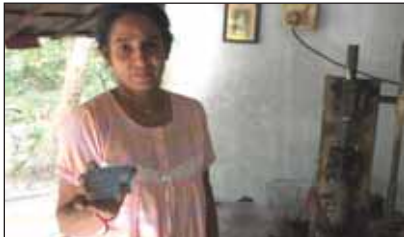
A Shram Jyothi client proudly upholding her PAN card

The Shram Jyothi project promoted by ESAF and International Labour Organization (ILO) has come to an end in January 2012. The objective of the project, which was started in Jan 2010 was to formalize small and micro enterprises of ESAF's clients. As part of the project almost 600 clients have benefitted out of the program with the end survey being conducted at Nagpur, Kerala and Tamil Nadu. The project enabled 85% of the beneficiaries in the