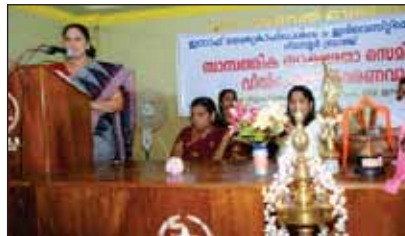
Financial literacy program at Nilambur in progress

ESAF has been regularly conducting financial literacy programs to educate the clients. In the month of January financial literacy programs were held at Cherpu on Jan 21, 2012 and at Nilambur on Jan 24, 2012.