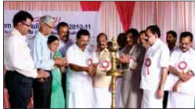
P.C Chacko inaugurating ESAF SHG Federation State General Body Meeting