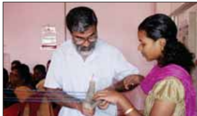
Training program in progress at Amballur

ESAF organizes Skill training programs for soap and soap powder and plastic coir products making at Amballur branch. A skill training program with the support of NABARD was organized at Vakathanam. A skill training program on Jewellery making was organized at Pozhiyur.