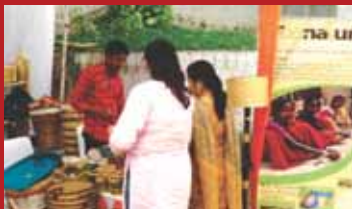
A still from ESAF stall at Lodhi road, New Delhi