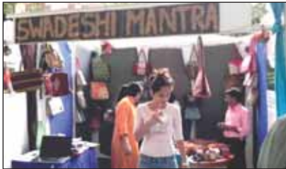
'Swadeshi Mantra' stall of ESAF at ISB Fair Trade Event

The team from ESAF Swasraya Producers Company Ltd. (ESPCL), emerged winners in terms of sales volume by registering close to Rs 30,000 in sales in 3 hours at the "Mercado Redefining Retail" Fair Trade event held at International School of Business, Hyderabad. Six fair trade member organizations participated in the competition and six leading Indian B schools including IIM A, ISB, XLRI, and Mudra managed the sales promotion, design and merchandising of the stalls. All the B school teams gave a