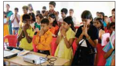
Jyothirgamaya programme in progress