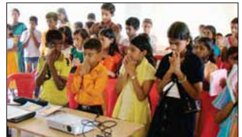
Jyothirgamaya programme in progress