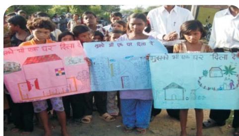
Awareness Program organized by ESAF on World Habitat Day

ESAF Central Zone team organized an awareness program on World Habitat Day, on Oct 08, 2009 at Indira Nagar. ESAF staff played skits at two venues in collaboration with CHF. The objective of the program was to make people aware on the importance of shelter, hygiene, rental problems and legal documents. Total 123 community members attended the program