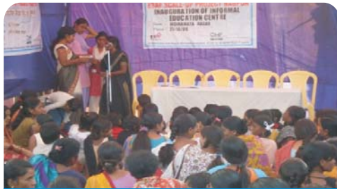
Launching of informal education center in progress