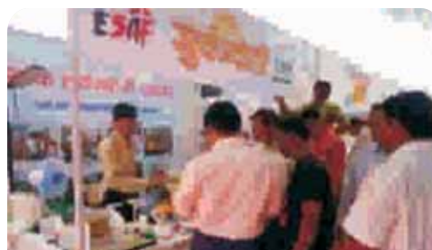
ESAF stall at the International Energy Summit held in Nagpur

On Jan 29, 2011, a meeting on the promotion of solar energy was held at VNIT, Nagpur. Many NGOs gave presentations on their ways and methods of promoting renewable energy. The participants were able to learn new ways that could facilitate the growth of renewable energy usage.