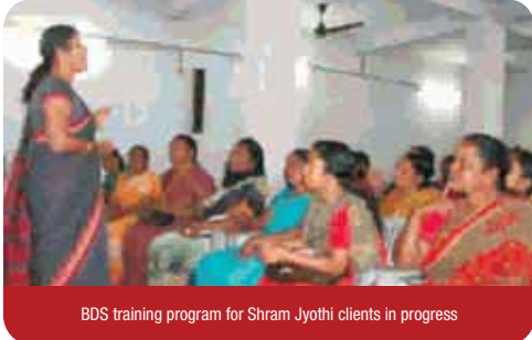
BDS training program for Shram Jyothi clients in progress

The certified course for Shram Jyothi clients promoted by ESAF and ILO in Kerala has come to an end on Feb 23 and 24, 2011. The training program included 6 modules and the training programs for the last module 'how to handle business crisis' were held at Vyapar Bhavan Hall, Perinjalam and Brothers Auditorium, Vadanappilly, respectively.